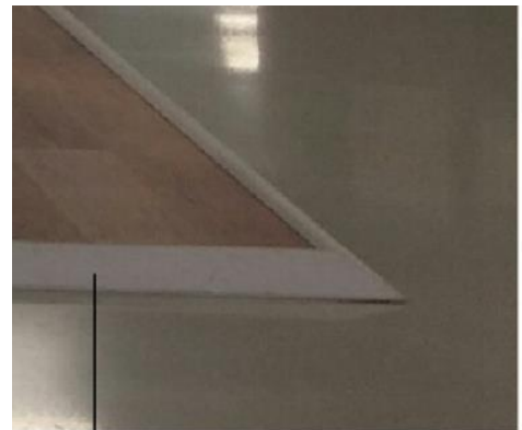
Raised floor (4cm) with sloping edges, finished with wooden laminate.

Please note that if your booth has any kind of elevation/platform, you are required to provide a ramp or sloped edging around the entire booth to ensure access for people with disabilities.